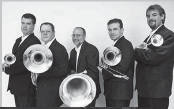
Basel Brass Quintet