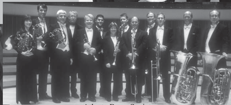
Atlanta Brass Society